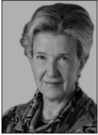
Committees Management Development and Compensation (Chair) Nominating and Corporate Governance