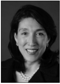
Committee Legal and Public Affairs